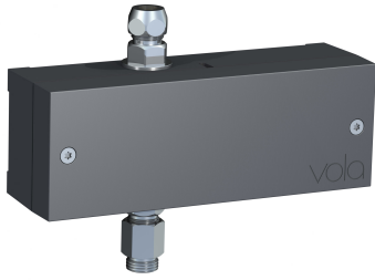
VR2617 Valve box.